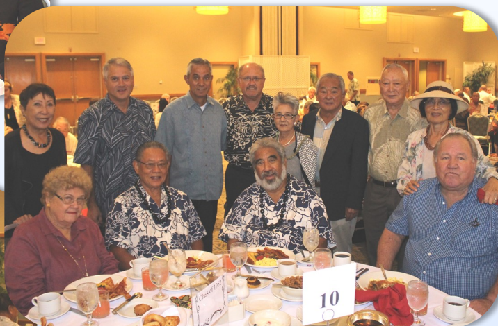
Kamehameha Class of 1952 and friends