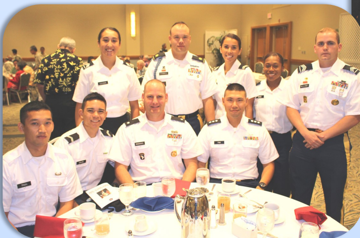
University of Hawaii ROTC guests