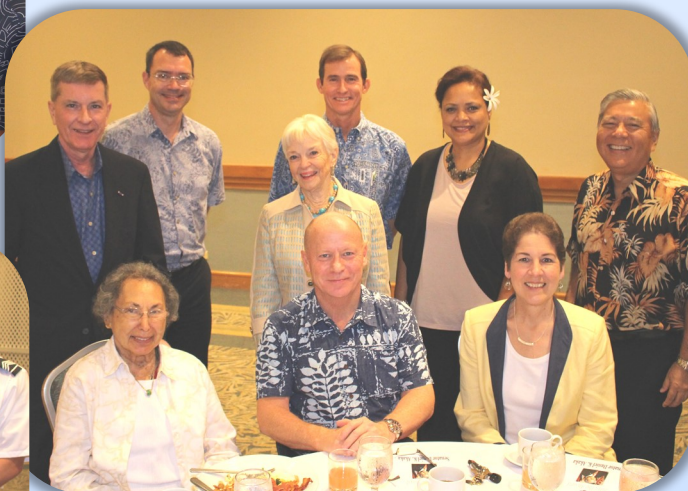
Outrigger Enterprises guests