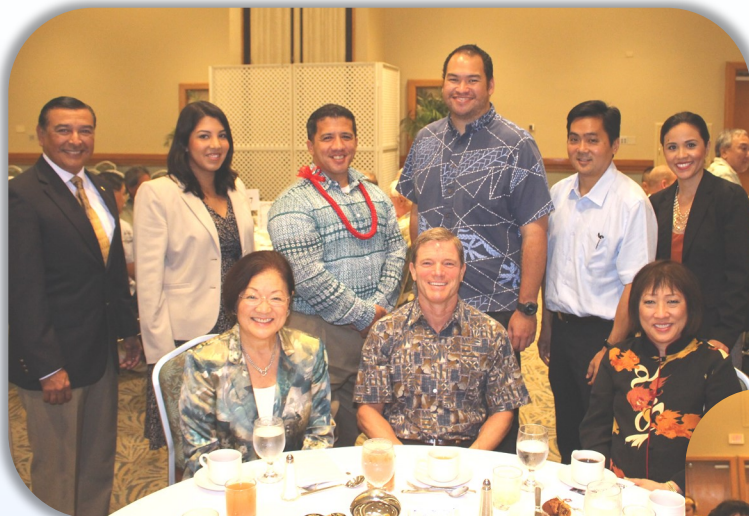
Chamber of Commerce of Hawaii guests