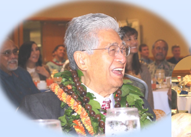
A smiling Senator Akaka and his family and friends listen to the event's opening remarks