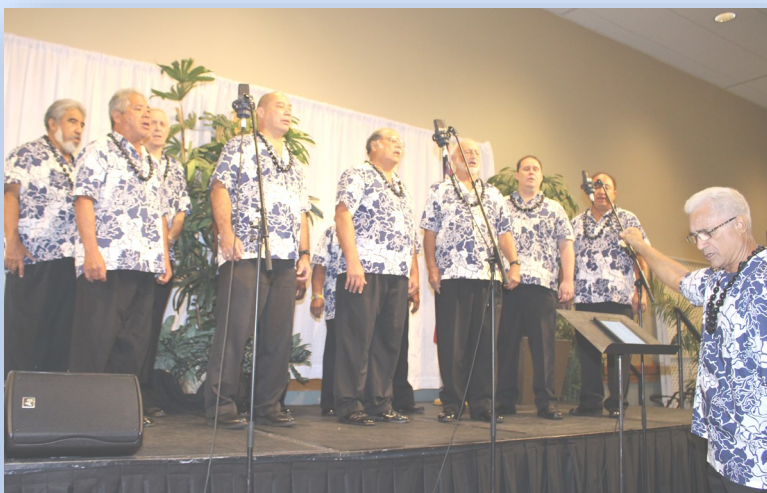
Kamehameha Alumni Glee Club perform