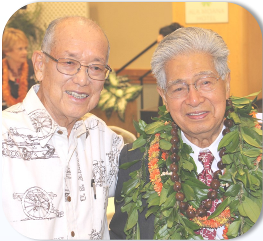
BG Edward Y. Hirata & Senator Akaka