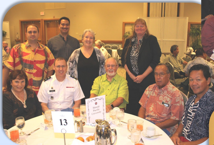
Hawaii Pacific University guests